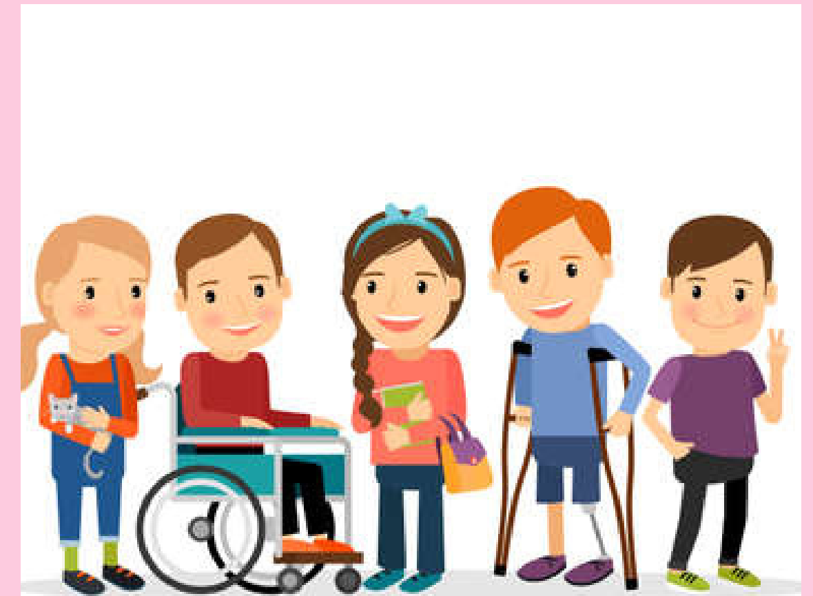
Caring for a disabled children

Users make crafts with recycled materials that they later sell in specific markets.